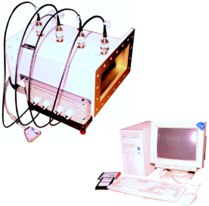
Fig.2: The RKR9 Directional Coupler Measurement System

Four antennas are located along the waveguide at a distance of a fourth of the waveguide wavelength. The diodes attached to the antennas convert the measured signal into a voltage signal that is amplified in a box. The amplified signal is evaluated by means of a Pentium PC that is equipped with a A/D card. The total system is shown in figure 2. The system provides either digital information, analog signals or a utility for process control. Figure 3 shows a screenshot of the RKR9 measurement software.